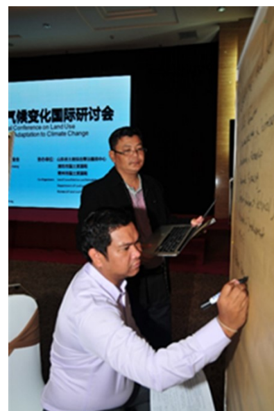
Photos: Participants working in a group