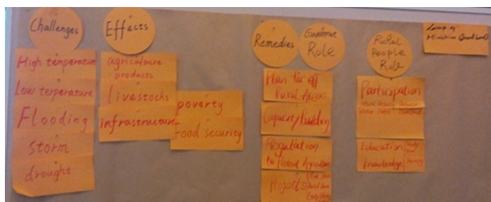
Photos: Presentation of findings